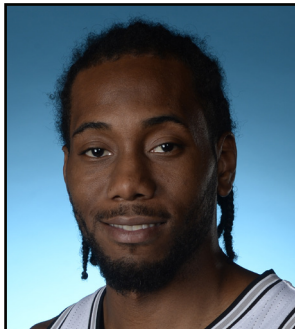
2 KAWHI LEONARD