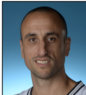
20 MANU GINOBILI