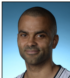
9 TONY PARKER