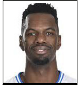
3 DEWAYNE DEDMON