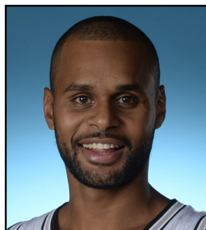
8 PATTY MILLS