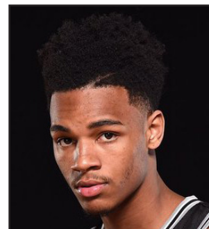
5 DEJOUNTE MURRAY